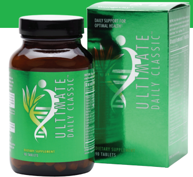
#USYG100084 DIETARY SUPPLEMENT 90 TABLETS

DIRECTIONS: Take 3 tablets daily with a full glass of water, or as directed by your healthcare professional. For best results, we suggest using this product as part of a full nutritional program that also includes Ultimate™ Classic 1 and Ultimate™ EFA 1 .